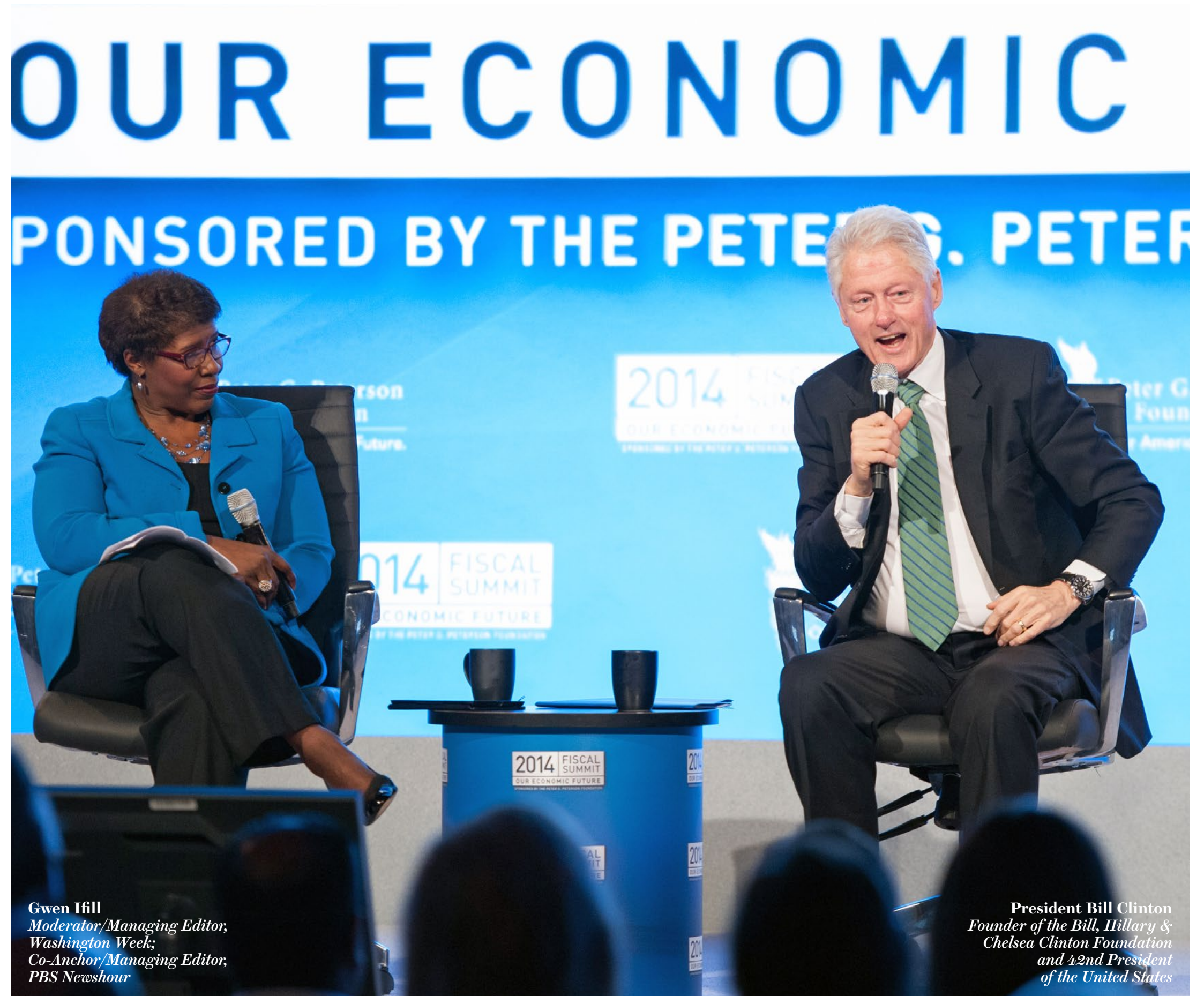
Gwen Ifill Moderator/Managing Editor, Washington Week; Co-Anchor/Managing Editor, PBS Newshour

To address this growing inequality, Clinton advised that “the main thing is we need a strategy that will increase employment and change the job mix,” with an end goal of “more vigorous job growth, [and] a tighter labor market, which will raise incomes.” He also stressed the importance of preschool, technical, and career education. Noting the importance of reducing inequality, he said, “what we should be trying to do is make sure that we're all growing in real terms together. And having the right budget for the government and the right investment strategy is a part of it.”