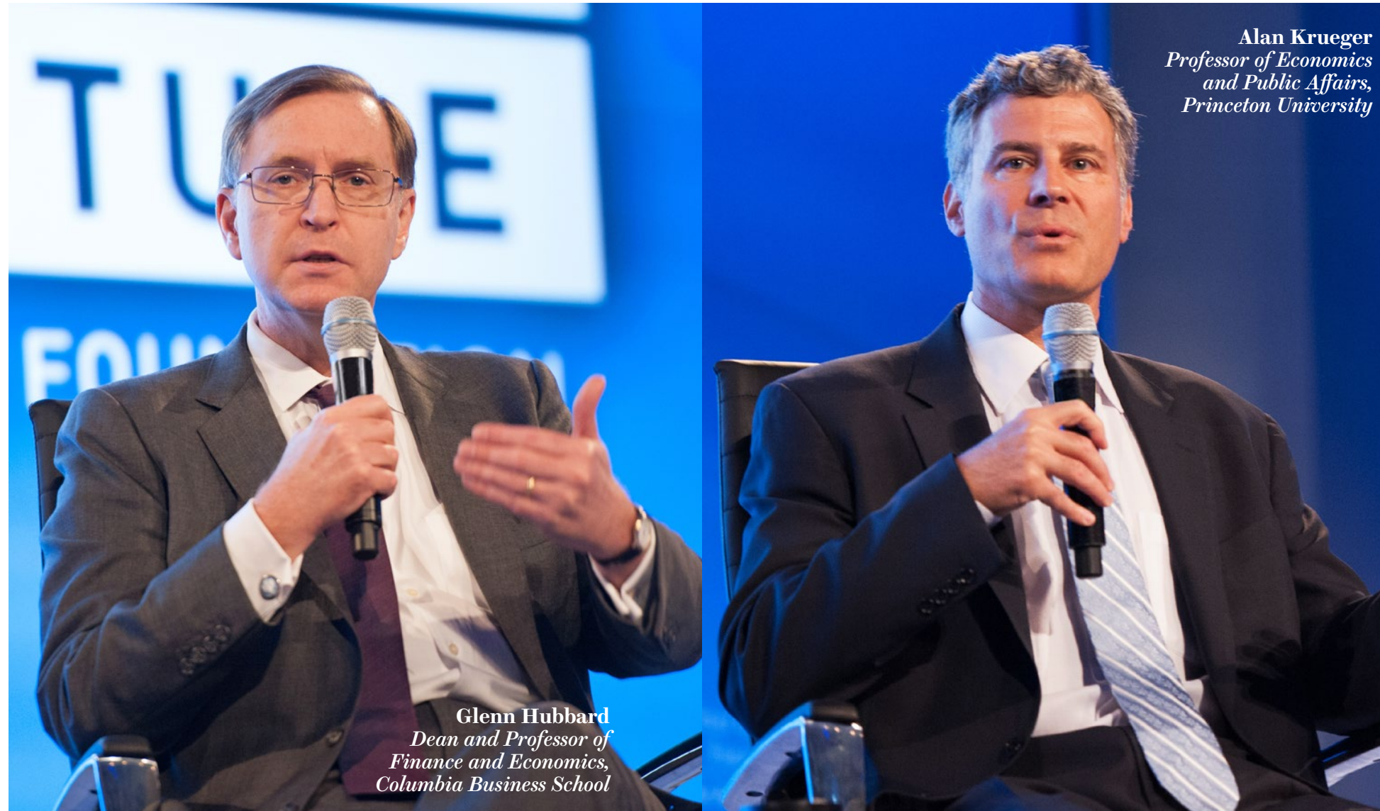
Glenn Hubbard Dean and Professor of Finance and Economics, Columbia Business School