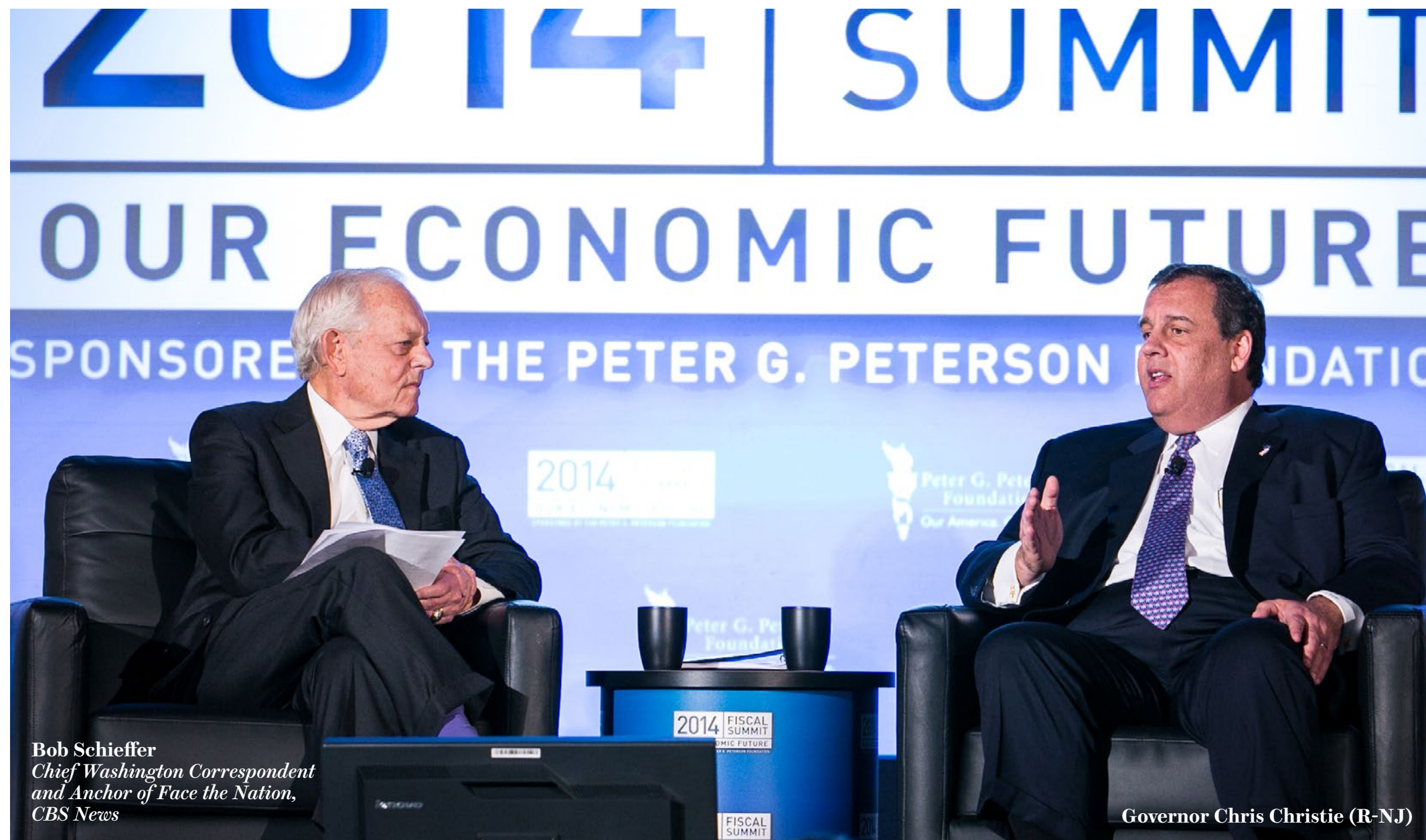
Bob Schieffer Chief Washington Correspondent and Anchor of Face the Nation, CBS News