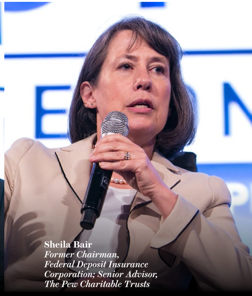
Sheila Bair Former Chairman, Federal Deposit Insurance Corporation; Senior Advisor, The Pew Charitable Trusts