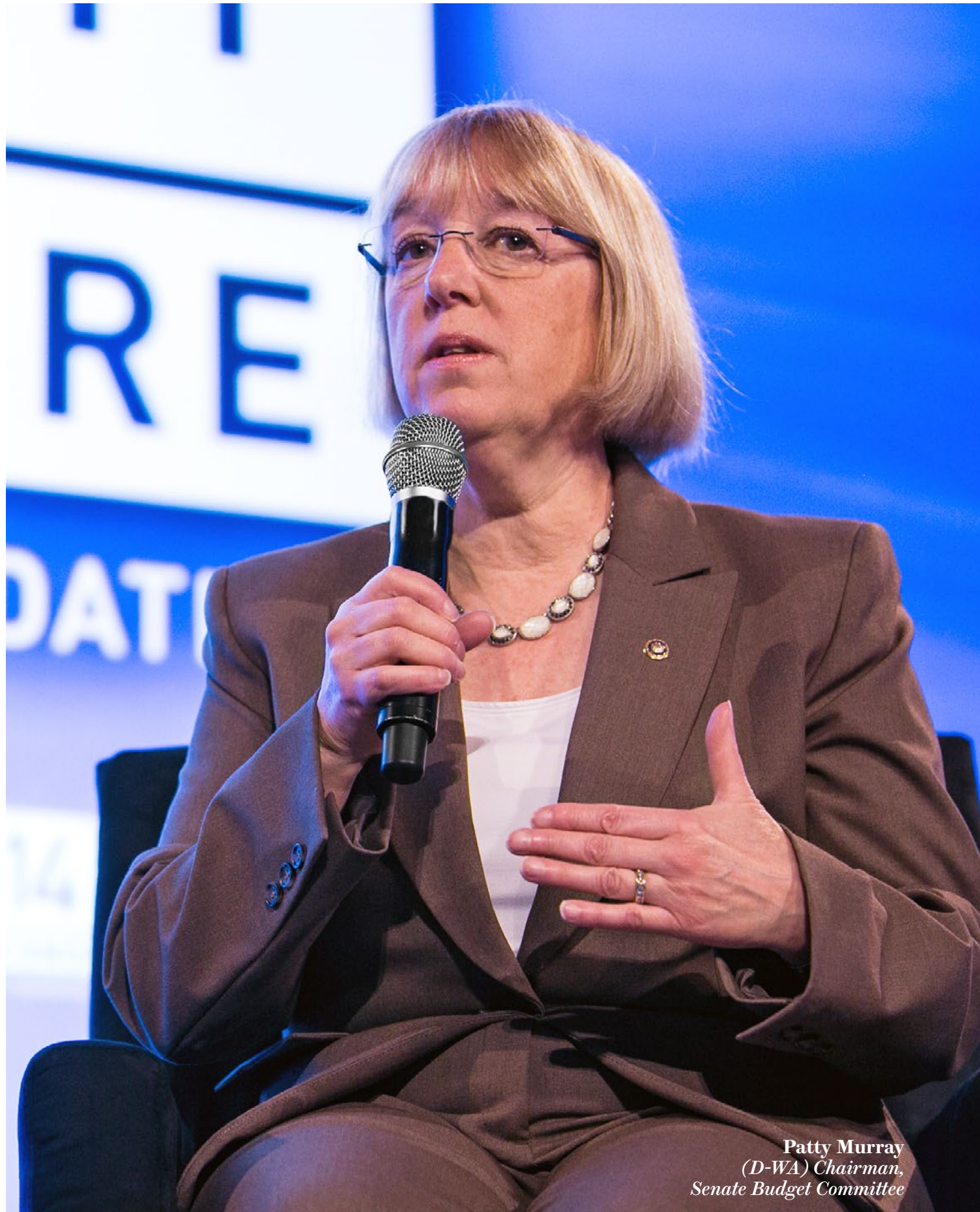
Patty Murray (D-WA) Chairman, Senate Budget Committee