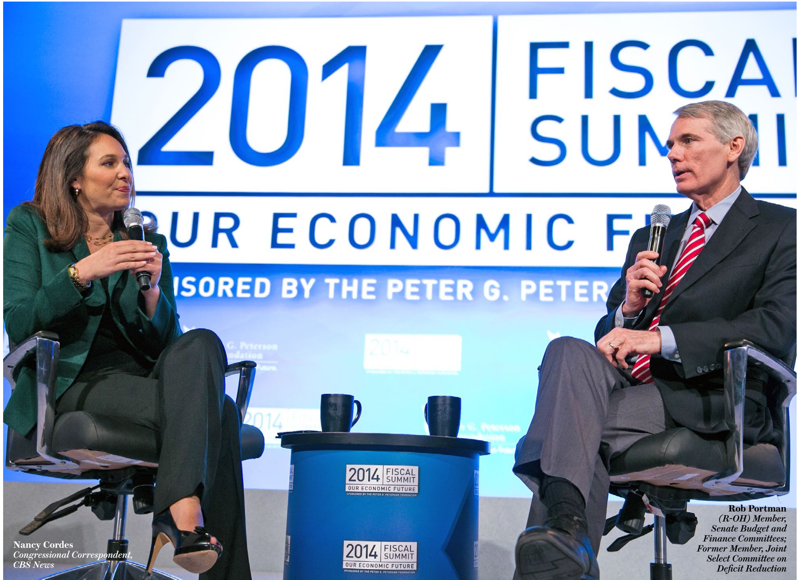
Nancy Cordes Congressional Correspondent, CBS News

Taking an optimistic view, Portman urged the importance of taking “full advantage of 2015, particularly the first six months of that year, when maybe there’ll be a little less politics, I hope, to try to make some of these changes, and do it, again, with the administration working with Congress.”