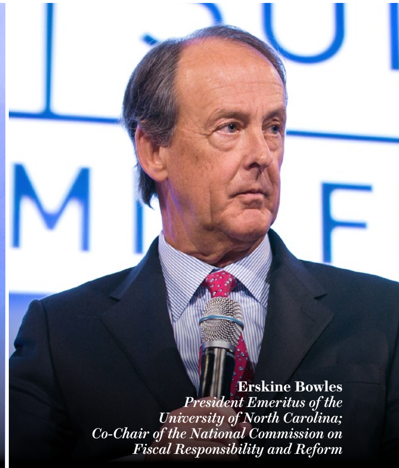
Erskine Bowles President Emeritus of the University of North Carolina; Co-Chair of the National Commission on Fiscal Responsibility and Reform