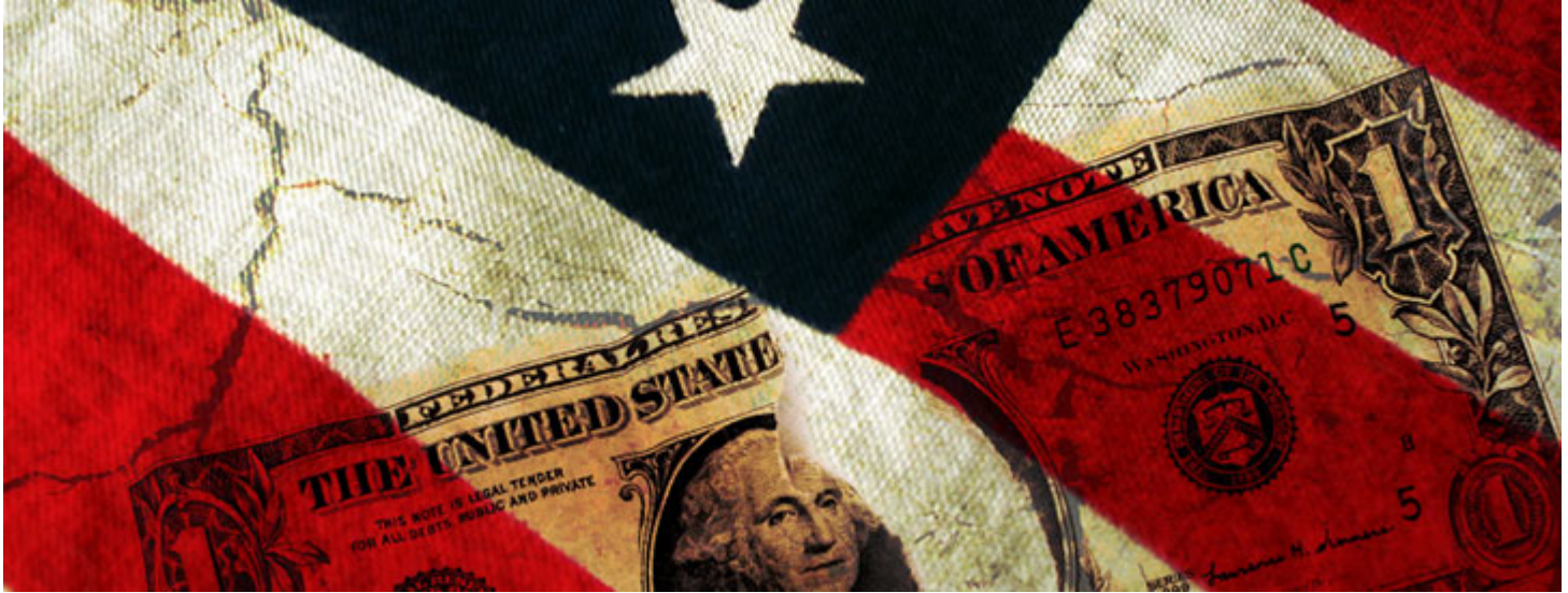
Special Report: The Cost of Crisis-Driven Fiscal Policy