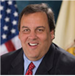
Governor Chris Christie

Chairman, Coalition for Fiscal and National Security; 17th Chairman of the Joint Chiefs of Staff