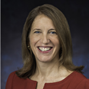
Sylvia Mathews Burwell

President, American University; 22nd U.S. Secretary of Health and Human Services