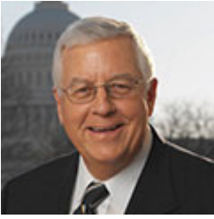
Senator Michael B. Enzi

(R-OH) 53rd Speaker of the United States House of Representatives