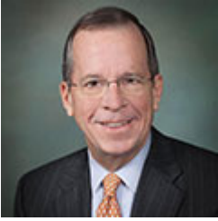
Michael Mullen, USN (Ret.)

Chairman, Coalition for Fiscal and National Security; 17th Chairman of the Joint Chiefs of Staff