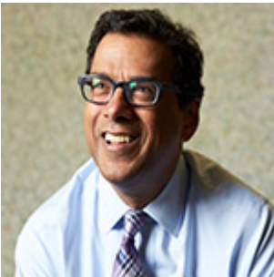
Dr. Atul Gawande

President, American University; 22nd U.S. Secretary of Health and Human Services