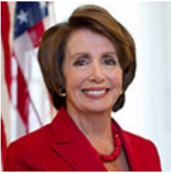
Speaker Nancy Pelosi

(R-WY) Chairman, U.S. Senate Committee on the Budget