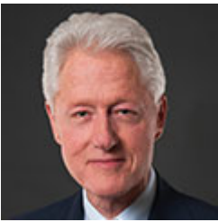
President Bill Clinton

Founder of the Bill, Hillary & Chelsea Clinton Foundation and 42nd President of the United States