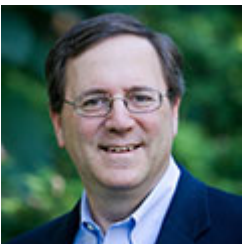
David E. Sanger

National Security Correspondent, The New York Times