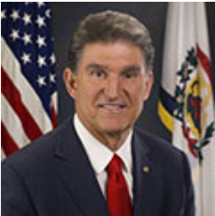
Senator Joe Manchin

(R-NJ) 55th Governor of the State of New Jersey