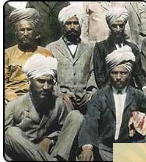
Sikh men arriving at Angel Island Immigration Station from kqed.org

Source: Pew Research Center analysis of U.S. Citizenship and Immigration Services data